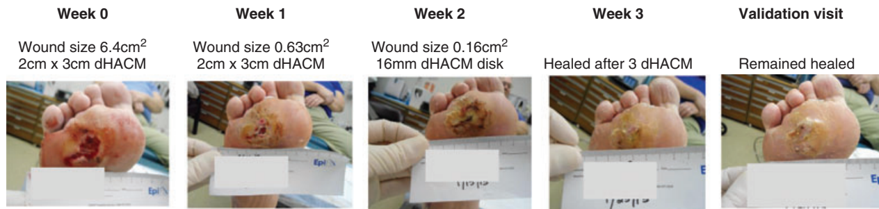
Figure 2 Male, 54 years of age with 6.4 cm 2 plantar ulcer of 48 weeks duration. Randomised to receive weekly dehydrated human amnion/chorion membrane (dHACM) application. Complete healing occurred after three applications of dHACM. Wound reduced in size by 90.1% after first dHACM application.